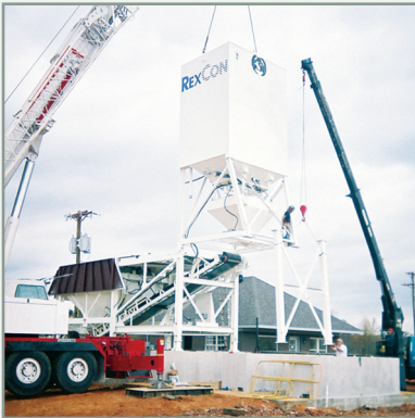
Hinged, gravity feed cement silo