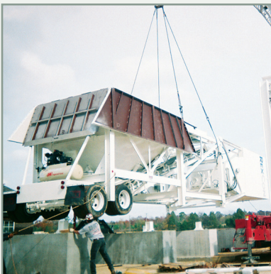
Portable or stationery installation