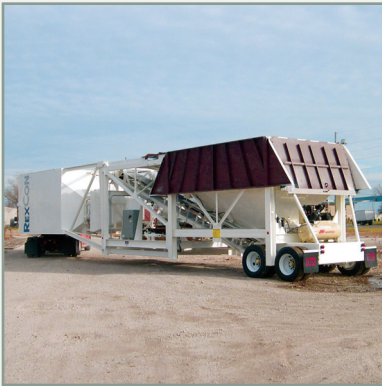
Single trailer transport