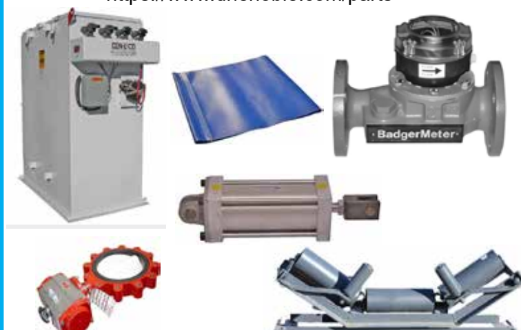
PLANT PARTS AND SERVICES https://www.dhenoble.com/parts

Van feeder $12,500.00, 50HP blower $21,500.00