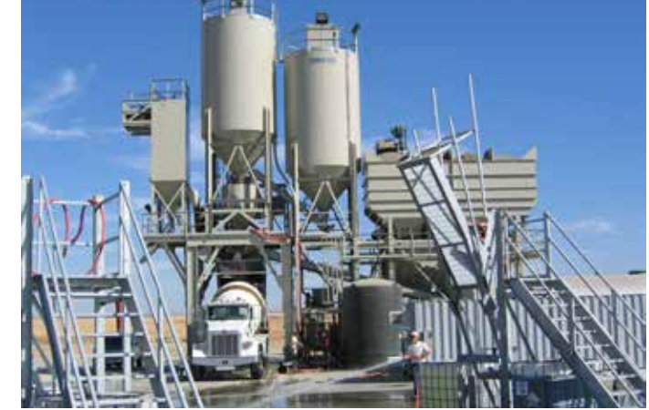
CON-E-CO PLP12 Portable Concrete Batch Plant. As shown $876,000.00