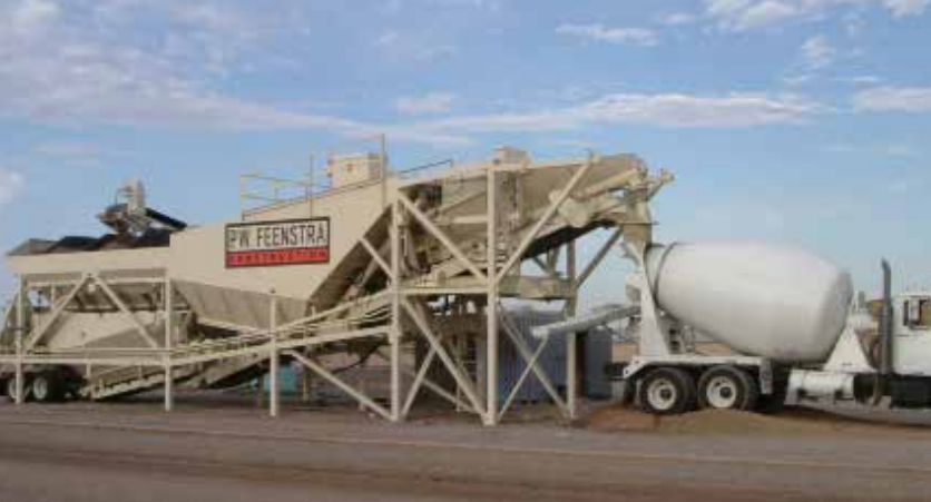
CON-E-CO Lo-Pro 427 Mobile Portable Concrete Batch Plant. Starting at $585,000.00