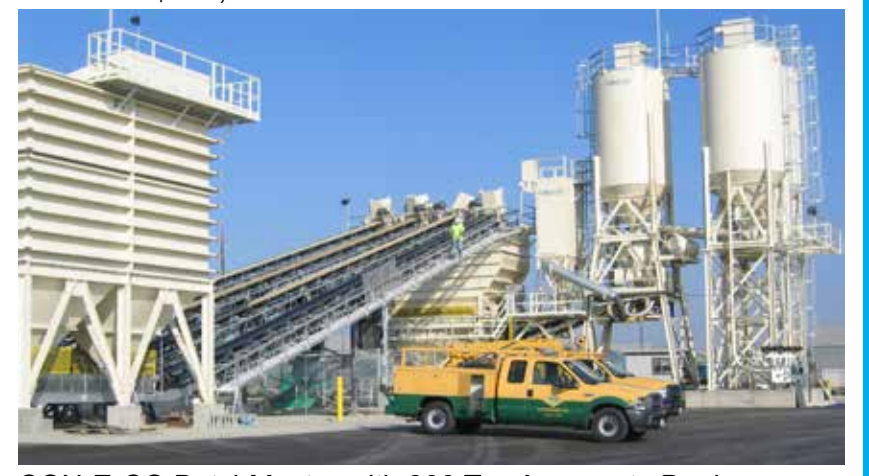
CON-E-CO BatchMaster with 800 Ton Aggregate Bunker. As shown $1,900,000.00

COMMAND-ALKON Batch Controls COMMANDbatch automation for the Ready-Mix, Precast and Material Handling industry