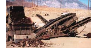
SMI 512 Screen $3,500.00/ wk.