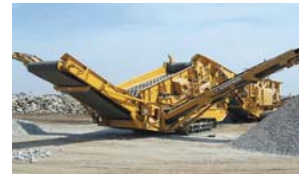
SMI Track 516T Screening Deck $5,400.00/ wk.