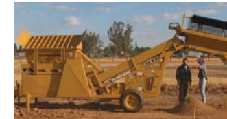
SMI Might Trommel $2,700.00/ month.