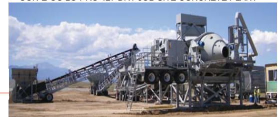
CON-E-CO LO-PRO 427CM WET JOB SITE CONCRETE PLANT