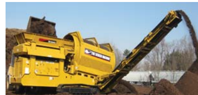
SMI 612T Track Trommel $3,000.00/ wk. SMI 612W Tire Trommel $2,600.00/ wk.

NEW SMI 612T & 612W Trommel 160 Square Feet of Wire Cloth Area Variable RPM Drum Speed Remote Control 612T Track 84 HP Yanmar Tier III Engine Unique Large Engine Compartment 4.5 Cubic Yard Open Ended Hopper 16 Hour 70 Gallon Fuel Tank Baffled 70 Gallon Hydraulic Tank USA Sourced Grade 80 Steel Uni-body Frame American Made in Columbus Ohio with American Made Labor and Materials