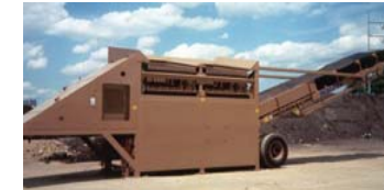
SMI 107C Scalper $2,700.00/ wk.