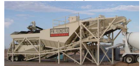
CON-E-CO LO-PRO 427 DRY JOB SITE CONCRETE PLANT

CON-E-CO CONTRACTOR SELF ERECT CONCRETE BATCH PLANT & RCC CONCRETE CON-E-CO has recently released a new self-erect paving plant that can be used in a dry or wet configuration.