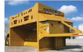
SMI 107D Scalper $2,200.00/ wk.