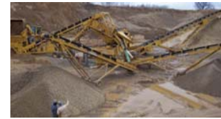
SMI Portable Sand & Gravel Screening and Wash Plant